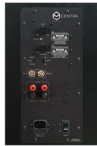
Optional A/V Console Subwoofer connections accessible from behind Audio/Video Console