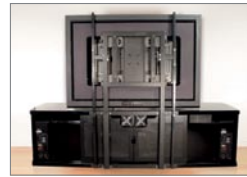
Optional M·Design Flat Screen TV Mounting System