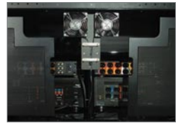
Sliding rear-access doors provide easy AV system access