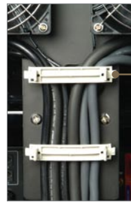
Monster Cable Management System™ organizes the cable "jungle"