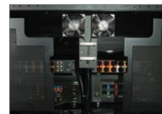
Sliding rear-access doors provide easy access to components