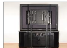
Optional M•Design Flat Screen Mounting System