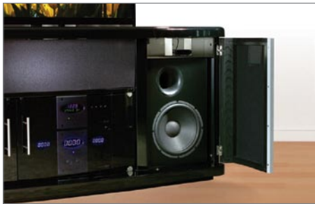
The Centra Audio/Video Console 600 seamlessly integrates optional Centra Console Subwoofers to give you deep, powerful bass—without having to see it.