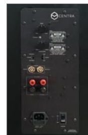
Optional Component Center Subwoofer connections accessible from behind Audio/Video Console