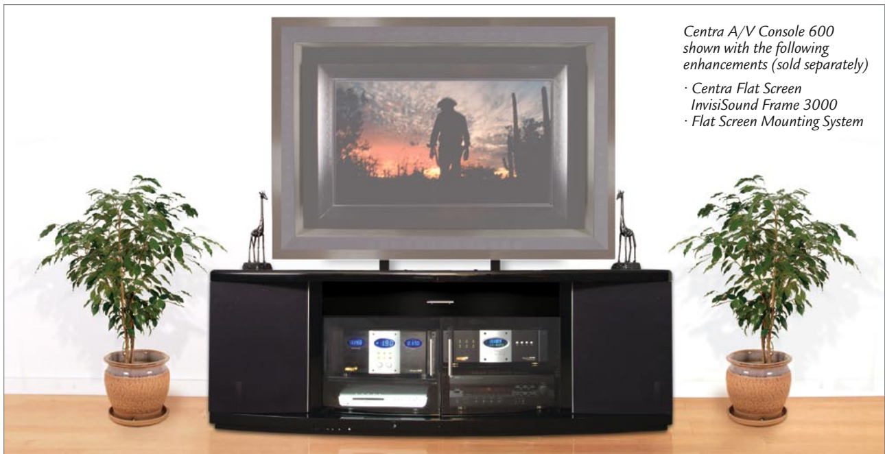
Centra A/V Console 600 shown with the following enhancements (sold separately)